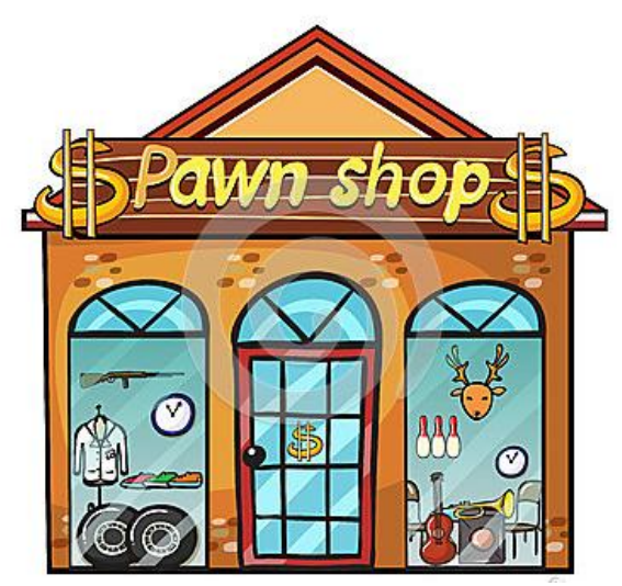
Fig (3) Pawn shop illustration