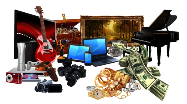
Fig (4) Diagram showing items in the Pawn shop